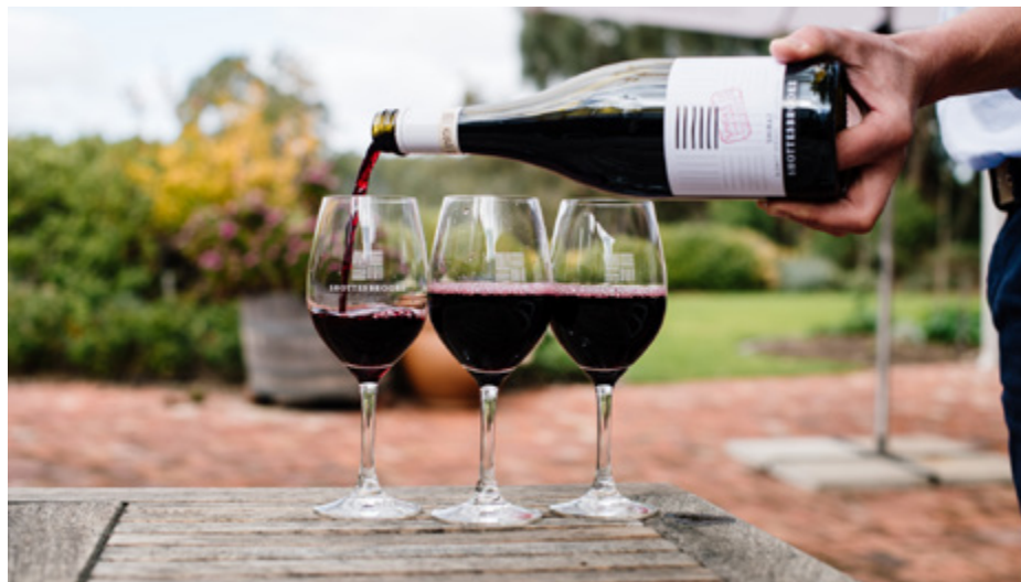
The Currant Shed Flourieu Peninsula HEY GENTS