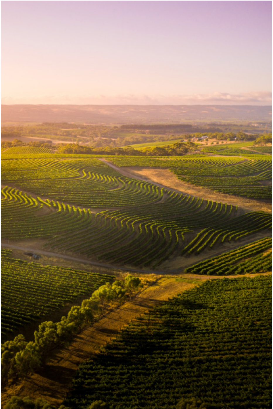
McLaren Vale Fleurieu Peninsula Isaac Forman, Series