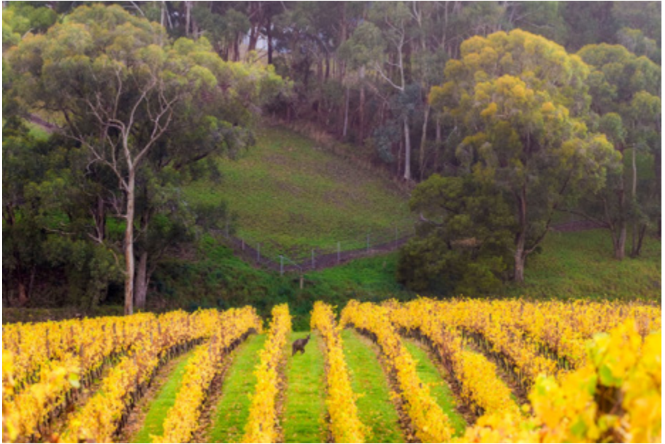
Piccadilly Adelaide Hills