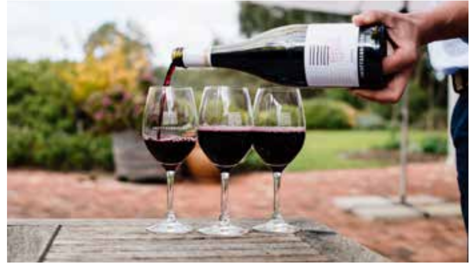
The Currant Shed Fleurieu Peninsula HEY GENTS