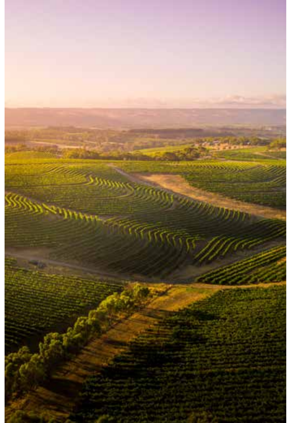
McLaren Vale Fleurieu Peninsula Isaac Forman, Serio

Conclude with a masterclass at Bekkers Wine overlooking the estate, which was recently named by Gourmet Traveller Wine as one of the top six wineries in the country, and lastly, head to the beach to view the spectacular Fleurieu Peninsula coastline.