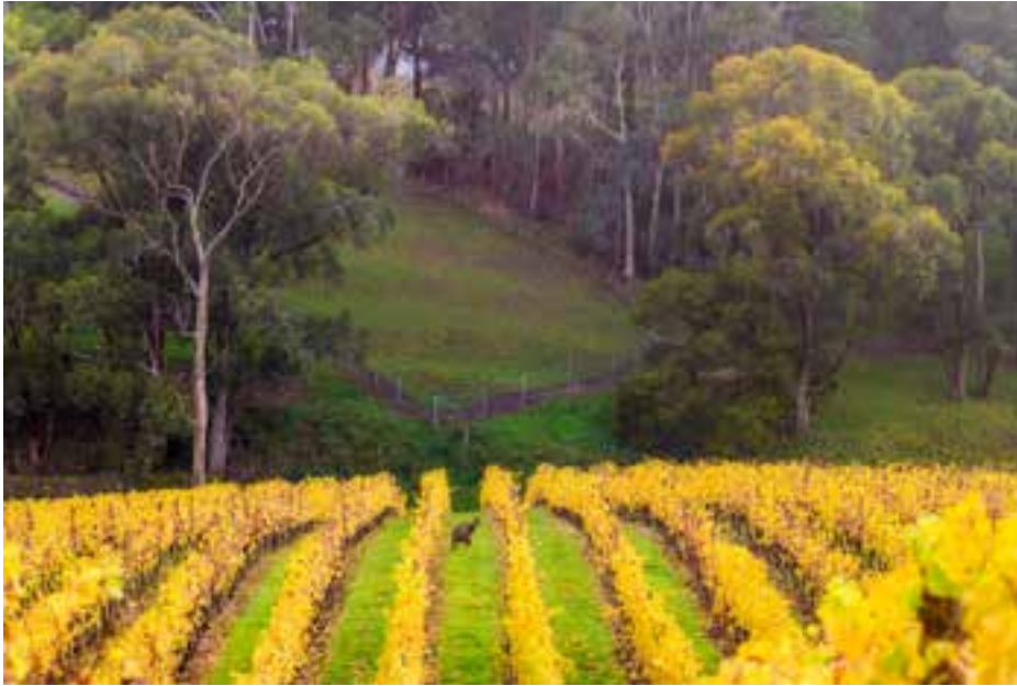
Piccadilly Adelaide Hills