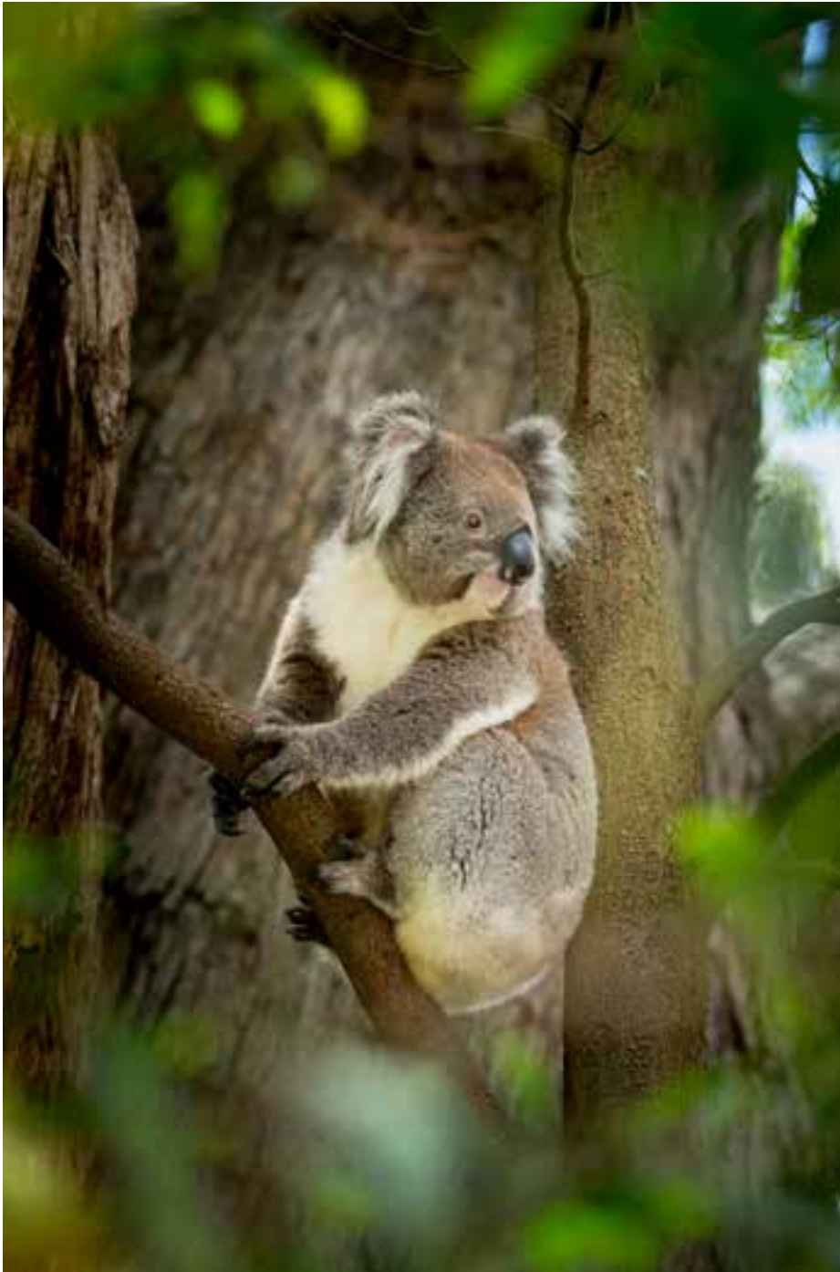
Cleland Wildlife Park Adelaide Hills