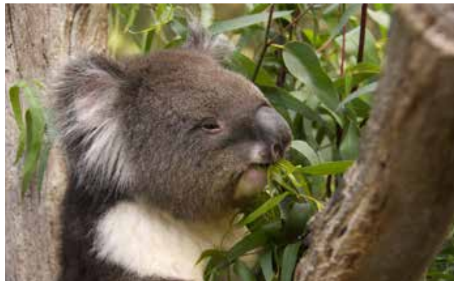
Koala - Cleland Wildlife Park Adelaide Hills South Australian Tourism Commission

Before your adventure comes to an end, spend some one-on-one time with a koala in a private session with a koala keeper, where you will hold a koala. A souvenir photograph will be gifted to you as part of this special memory. Learn interesting facts about the history and future of the koala, fall in love with their beautiful aroma, and be delighted at their thick, soft grey fur and big black noses.