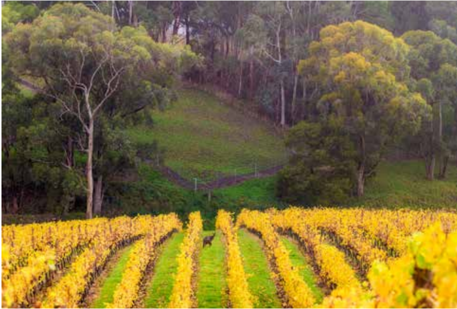
Riccadilly Adelaide Hills