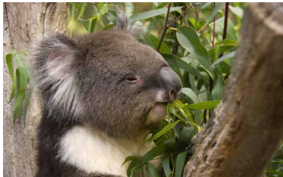
Koala - Cleland Wildlife Park Adelaide Hills South Australian Tourism Commission

Before your adventure comes to an end, spend some one-on-one time with a koala in a private session with a koala keeper, where you will hold a koala. A souvenir photograph will be gifted to you as part of this special memory. Learn interesting facts about the history and future of the koala, fall in love with their beautiful aroma, and be delighted at their thick, soft grey fur and big black noses.