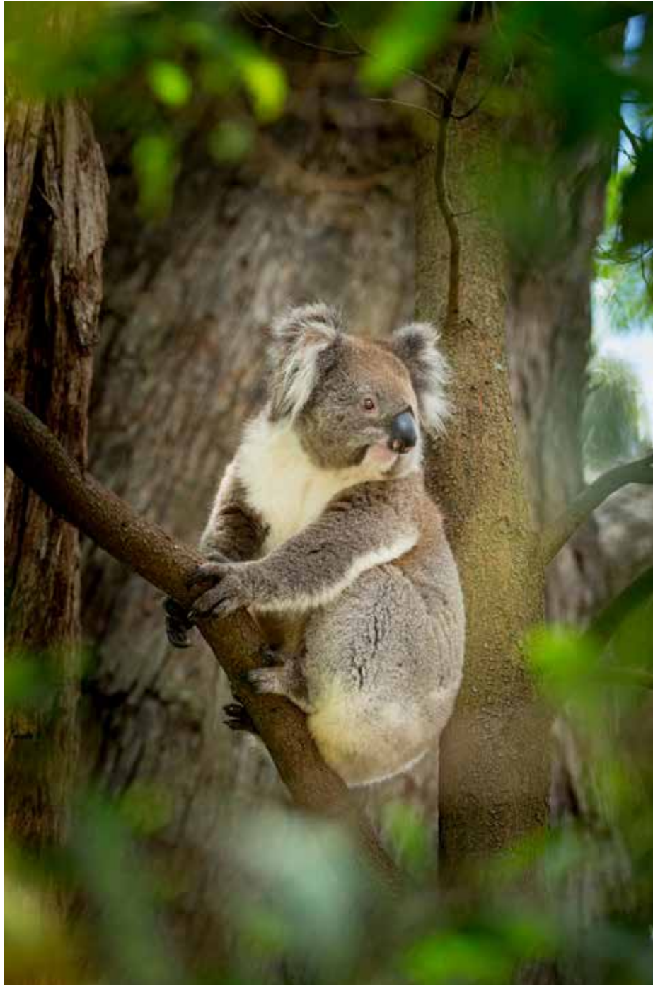
Cleland Wildlife Park Adelaide Hills