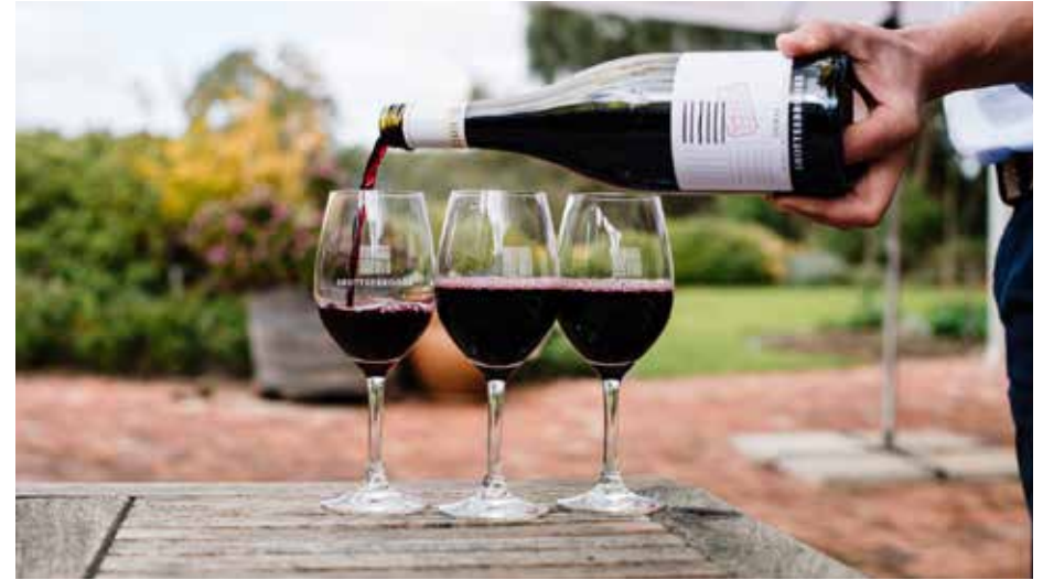
The Currant Shed Fleurieu Peninsula HEY GENTS