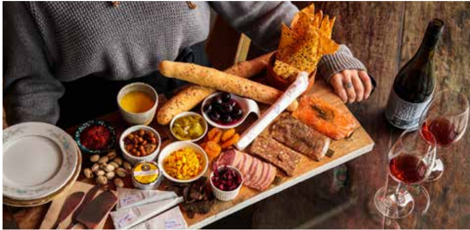
David Franz Barossa Duy Dash