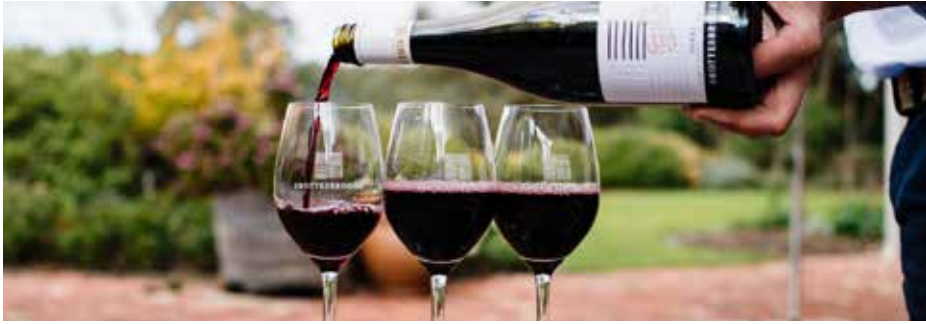
The Currant Shed Fleurieu Peninsula HEY GENTS