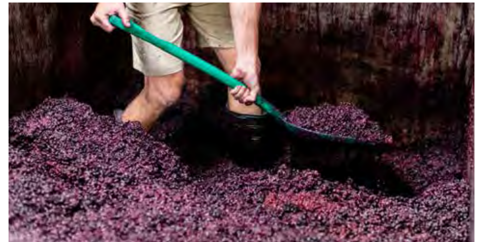
Henschke Barossa Andre Castellucci

DURATION 7 hours Depart at 9:45am and return 4:45pm