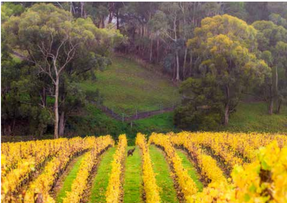
Piccadilly Adelaide Hills

6 hours Depart at 10:30am and return at 4:30pm