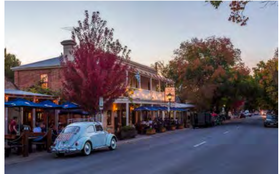
Hahndorf Adelaide Hills

DURATION 5 hours Depart at 12pm and return at 5pm