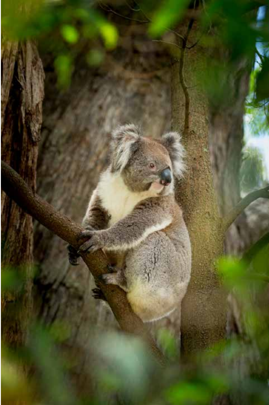
Koala - Cleland Wildlife Park Adelaide Hills